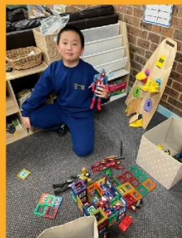
Fun Imaginary play