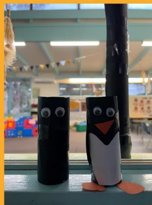
Toilet Paper roll activities!